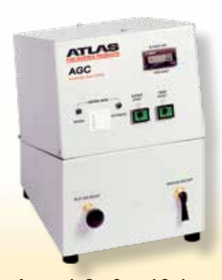
Automatic Gas Control Option

Auto flame impingement and electronic control ensure repeatable test results