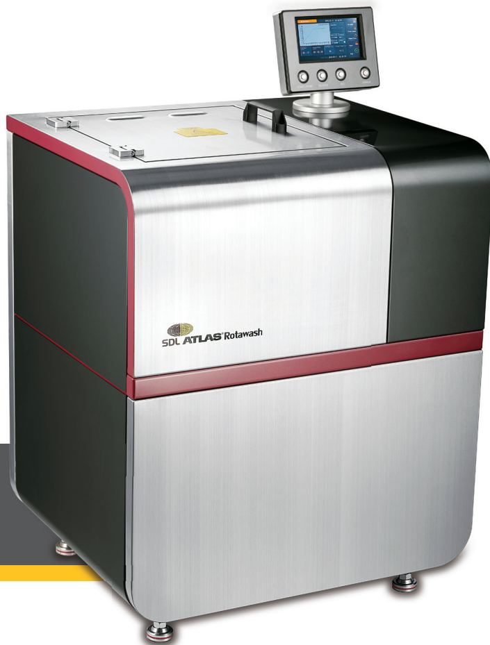
8 Container Model

Smaller sized instrument designed to conserve valuable lab space while providing maximum testing flexibility.