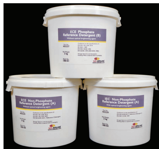
ECE and IEC Detergents