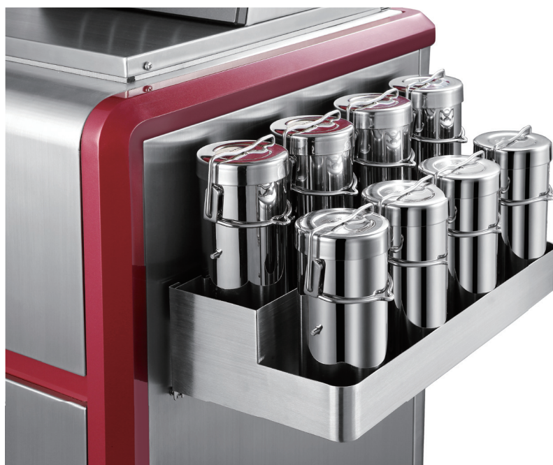
Optional Side Mounted Container Holder

Optional, detachable, side-mounted container holder to conveniently store sample containers when not in use. Can be mounted on either side of instrument