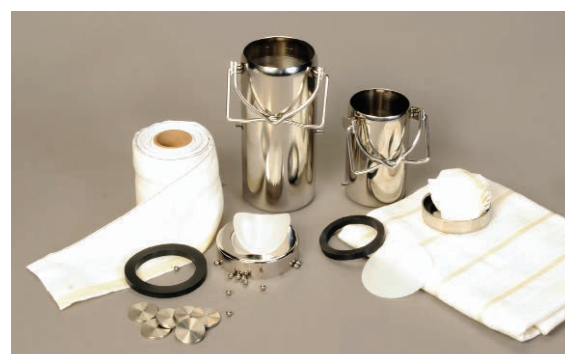
Colorfastness to Washing Accessories and Multifiber