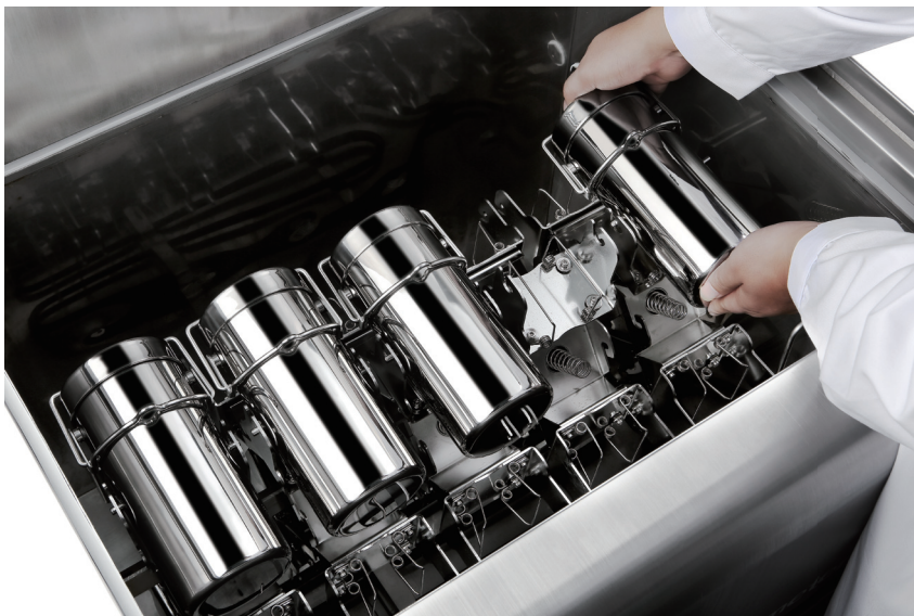
Press-in-place loading for sample containers

SDL Atlas offers two options for users in evaluating colorfastness to washing, the Launder-Ometer and the Rotawash. Both instruments are designed to conduct colorfastness to washing and dry cleaning in compliance with all major international and retailer standards for low temperature tests.