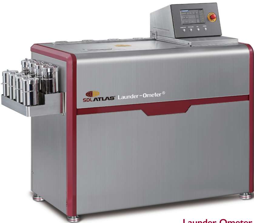
Launder-Ometer with Optional Detachable Container Holder